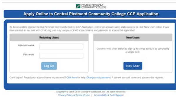
Figure 1 Use or create your CFNC.org username and a password.

This page lists the general information about completing an application and quick reminder that applications without the social security number will take longer to process and in many cases the social security number is required.