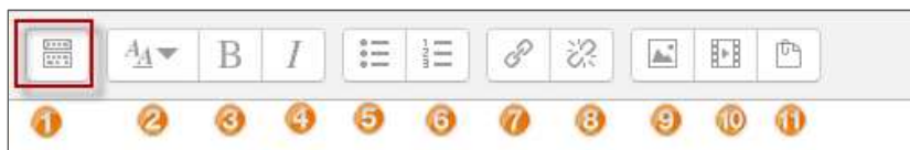
Figure 2: Text menu first row icons