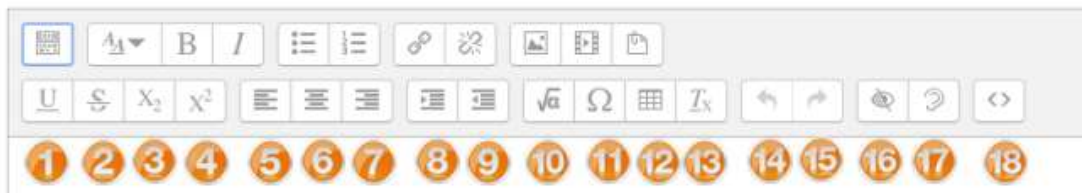
Figure 3 Text Menu: Expanded view